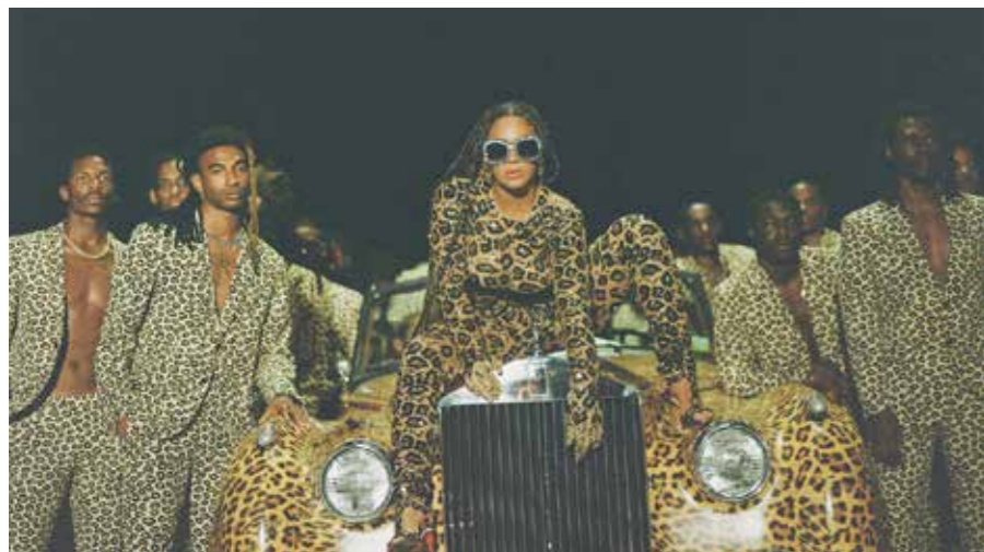
Above: Beyoncé's Black is King cover.