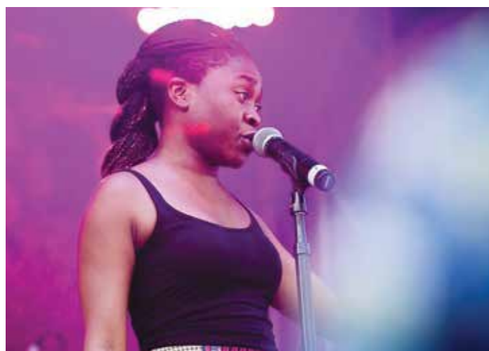
Below: Sampa the Great during a past performance.